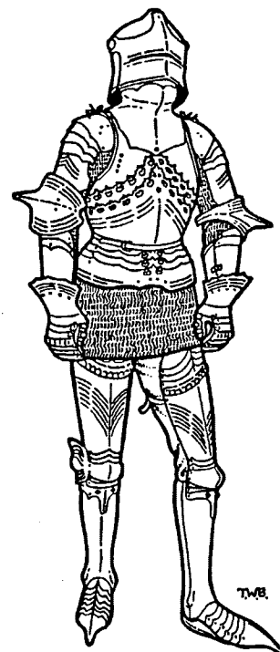
Composite North Italian Armor c.1460 Metropolitan Museum of Art